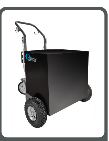
ART.NO. 28391 Heavy duty safety drum trolley, air wheels