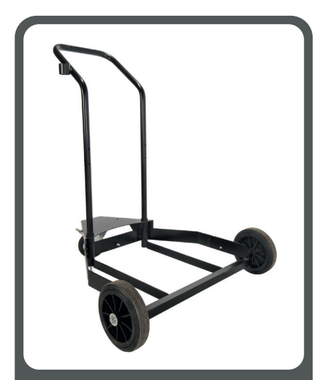
ART.NO. 28645 Trolley for 180 kg / 208 l